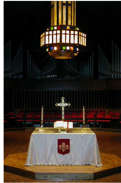
The Centrum / Ceremony Seats up to 700

Marriage, in addition to whatever legal implications it carries in the secular world, is, within the Church, a time of holy covenant making. The parties involved are certainly the bride and groom - and God (directly and through God's people, the Church). Holy marriage is fundamentally a sacred relationship that reflects a desire of our souls which is part of our created nature.