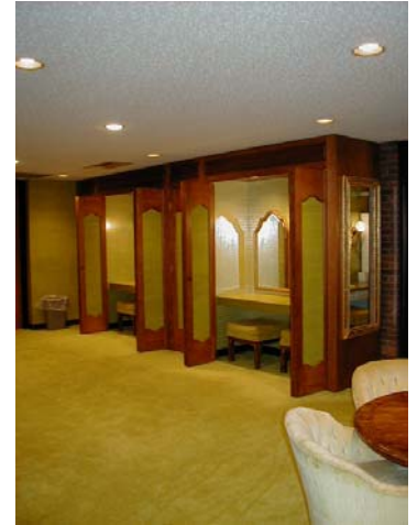
The Bride's Room / Women's Dressing area

Couples desiring to be married in this Church will meet with the Minister for the purpose of becoming better acquainted and for a review of the rite of marriage. During this conference the personal information sheets will be provided to the Minister. At the conclusion of this conference, the Minister will inform the couple as to whether or not the marriage may be held here. If in the affirmative, the date and time of the wedding shall be set and an appointment with the Wedding Coordinator can be made.